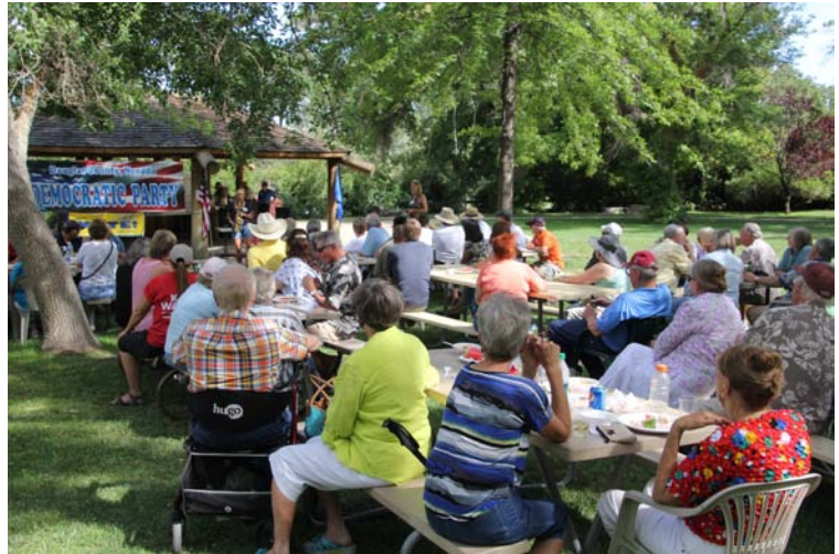
Our annual barbecue at Mormon Station State Park.